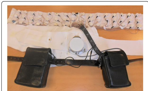
Figure 1 Vibrotactile feedback device. The vibrotactile display, elastic corset, IMU, PC104, and battery pack.

Post-processing was performed using MATLAB (MathWorks, Natick, MA). The IMU raw data was low-pass filtered using a 4th order Butterworth filter (filtfilt.m). Gait initiation and termination were excluded prior to calculating all parameters. The root-mean-square (RMS) of M/L and A/P tilt and overall sway was calculated over a fixed distance for each trial. Percentage of time spent in each of the tactor activation zones (null, low, high) was also calculated on a trial-by-trial basis. Pacing information was approximated from the number of hand-counted gait cycles and the sampling rate. Individual repetitions comprising sets of similar display configurations were averaged