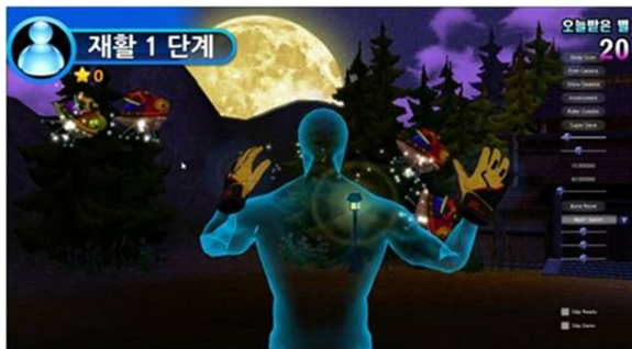
Bug Hunter Game