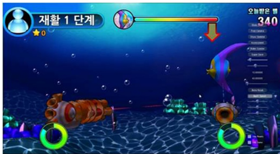
Underwater Fire Game