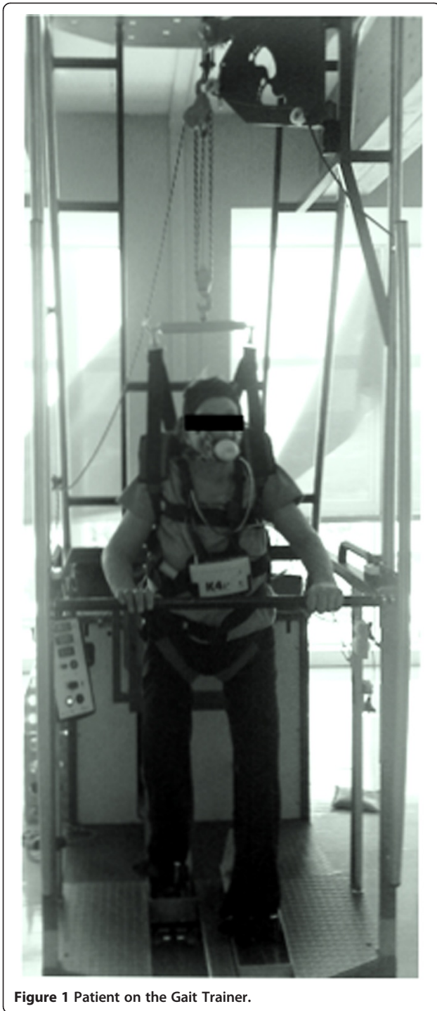
Figure 1 Patient on the Gait Trainer.

performance: ventilation ( V'E l/min), oxygen consumption ( V'O_2 ml/kg/min), carbon dioxide production ( V'CO_2 ml/kg/min), respiratory exchange ratio (RER, i.e. V'CO_2/V'O_2 ), heart rate (HR beats per minute- bpm) and walking speed (m/min). For the OWT, mean walking speed was calculated as the ratio of distance to time; thus, the walking speed obtained in the last 2 min of data collection was considered. Finally, as an index of the exercise intensity