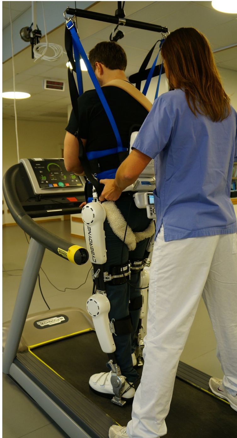
Figure 1 Illustration of training.