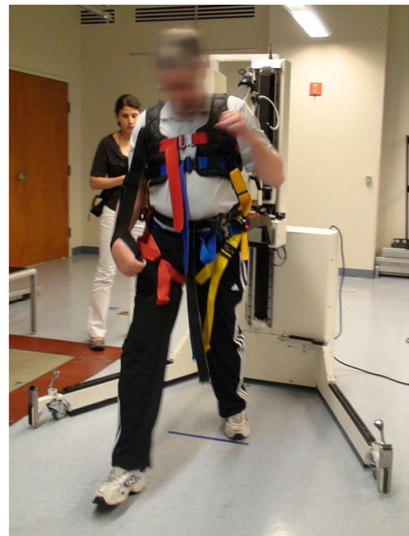
Figure 1 Overground robotic gait and balance system (KineAssist™) use to provide external forces at the pelvis during walking (i.e. "push mode" walking).

While a motorized treadmill has been shown to be successful in assisting individuals post-stroke to walk at higher speeds, we sought to test a new robotic system, the KineAssist Walking and Balance Training System (Figure 1), which has the possibility of "pushing" individuals to walk at very high overground speeds and, yet,