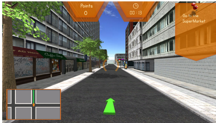
Fig. 2 Three-dimensional street view of Reh@City. In a first-person navigation, users are given goal instructions supported with a mini-map indicating the optimal path (green line and arrow). Time and point counters are used to provide feedback on performance